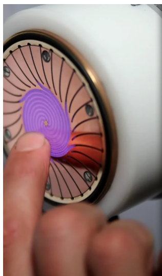
Fig. 2: A demonstration of the author touching the surface of the discharge head while it is energised